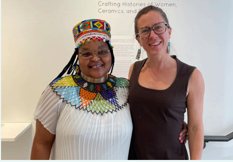
Crafting Histories of Women, Ceramics, and